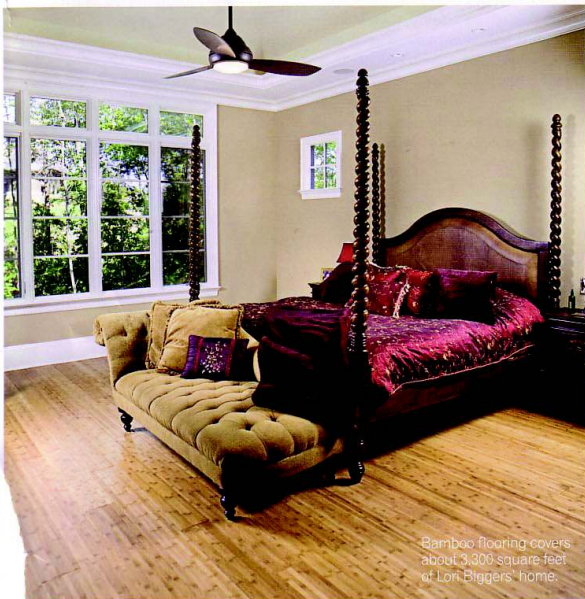
Bamboo flooring covers about 3,300 square feet of Lon Biggers' home.